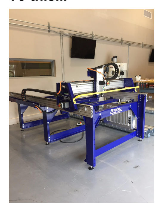
Follow us on Twitter!